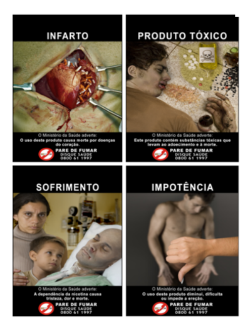
Figure 3. Examples of warnings on cigarette packages in Brazil.

The validation process indicates that SimSmoke predicts less well for two age groups, which may reflect limitations in the model or in the data used to validate SimSmoke. SimSmoke underpredicted the smoking rate reduction for 1989–2008 for those aged 18–24 y. Consistent with the literature, SimSmoke assigns a small value to the impact of warning labels on the young, who are often thought to ignore or resent warnings. However, Brazil has extensively tested their warnings (as portrayed in Figure 3) with younger smokers [35], so that they may have a greater impact than found in previous studies. In particular, health warnings tested well for non-smokers below 24 y and, although aversive with loss-framed content [36], may have reduced initiation. The strong health warnings may have acted synergistically with price increases and stricter smoke-free air laws to obtain the dramatic reductions in smoking initiation since 2003. Additionally, SimSmoke overpredicts the smoking reduction among those aged 45–64 y. Policies, especially those encouraging cessation, may need to be directed at this age group.